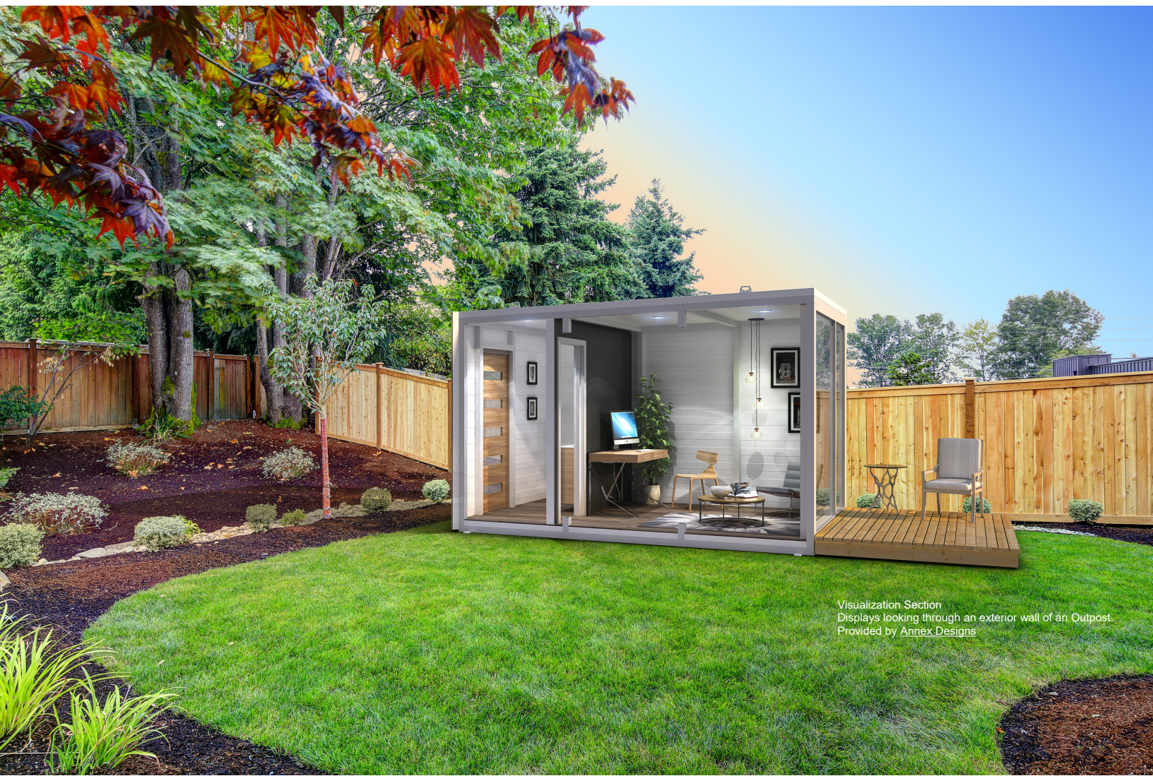
Visualization Section Displays looking through an exterior wall of an Outpost. Provided by Annex Designs